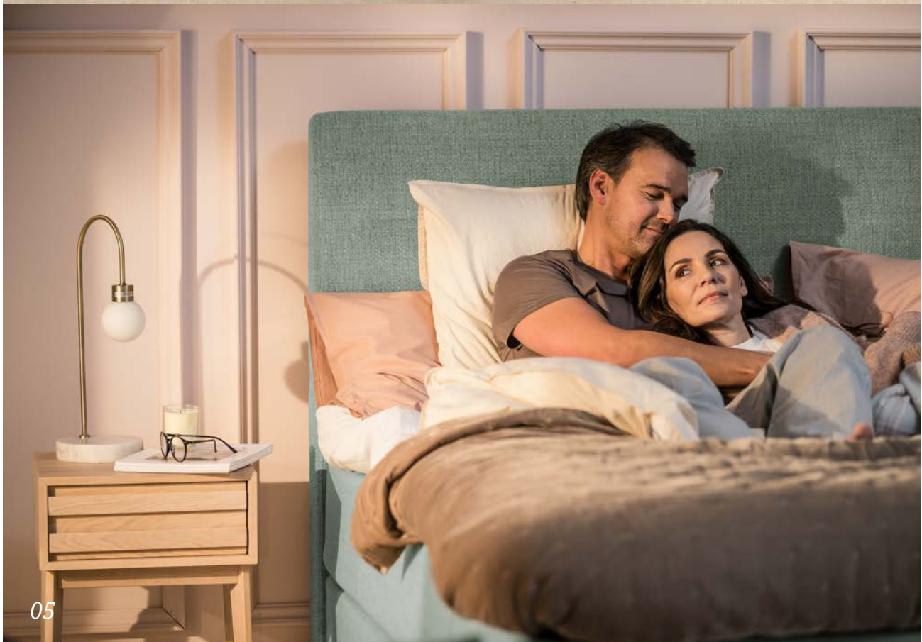
04. Nest headboard. Saturn ottoman. 05. Eicon bedside table. Fenix Plus headboard. All bedside tables are available in oiled oak, whitewashed and black.