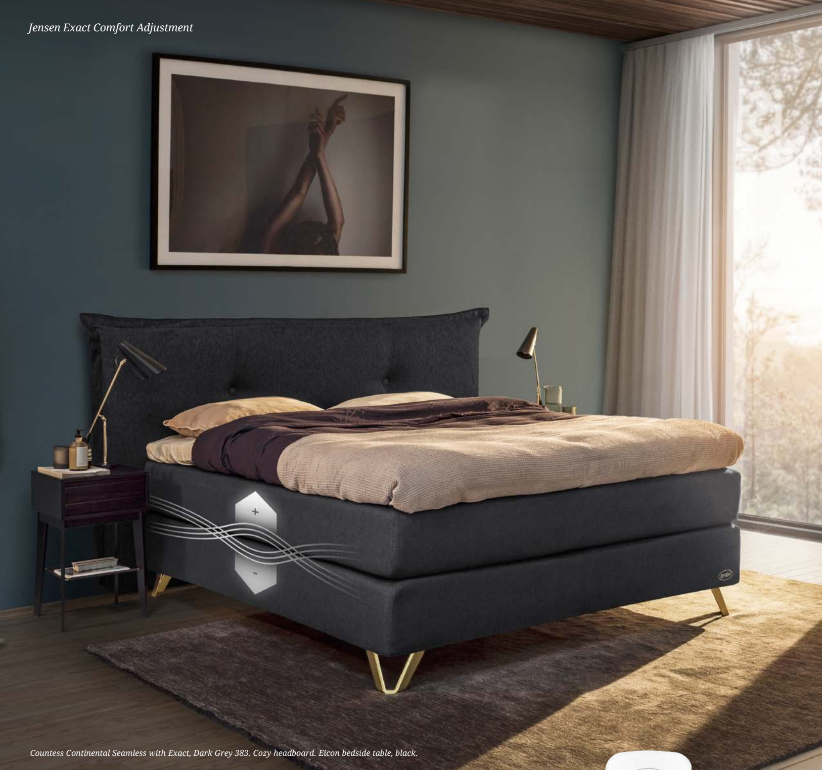
Countess Continental Seamless with Exact, Dark Grey 383. Cozy headboard. Eicon bedside table, black.