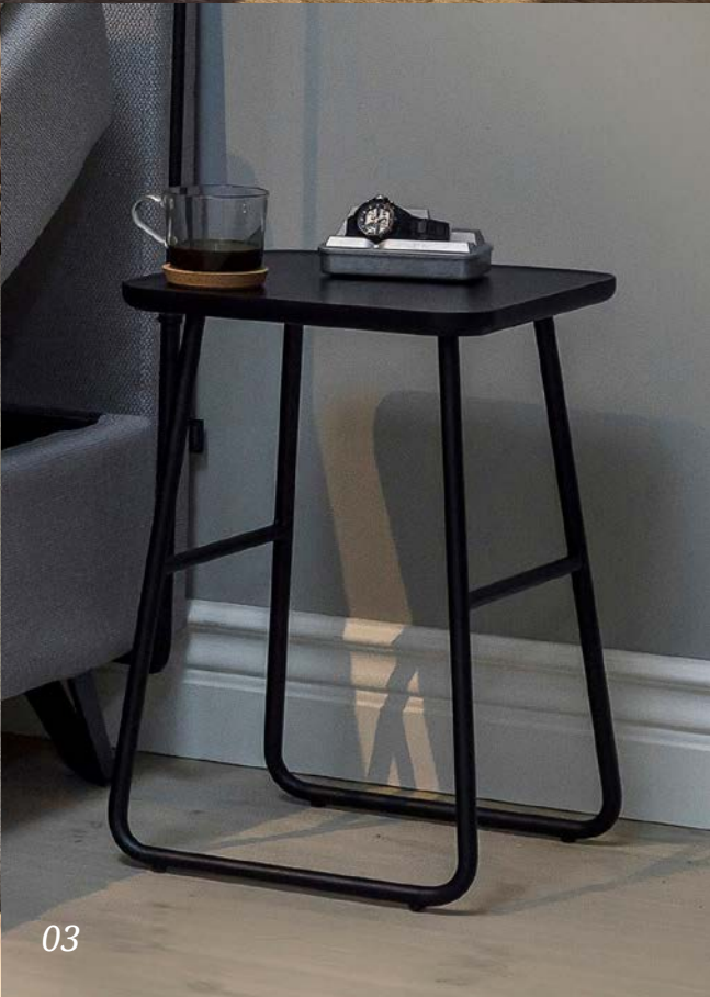
01. Fenix Plus jubilee headboard. Eicon bedside table. 02. Cozy headboard. 3. Add-on Floor bedside table. All bedside tables are available in oiled oak, whitewashed and black.