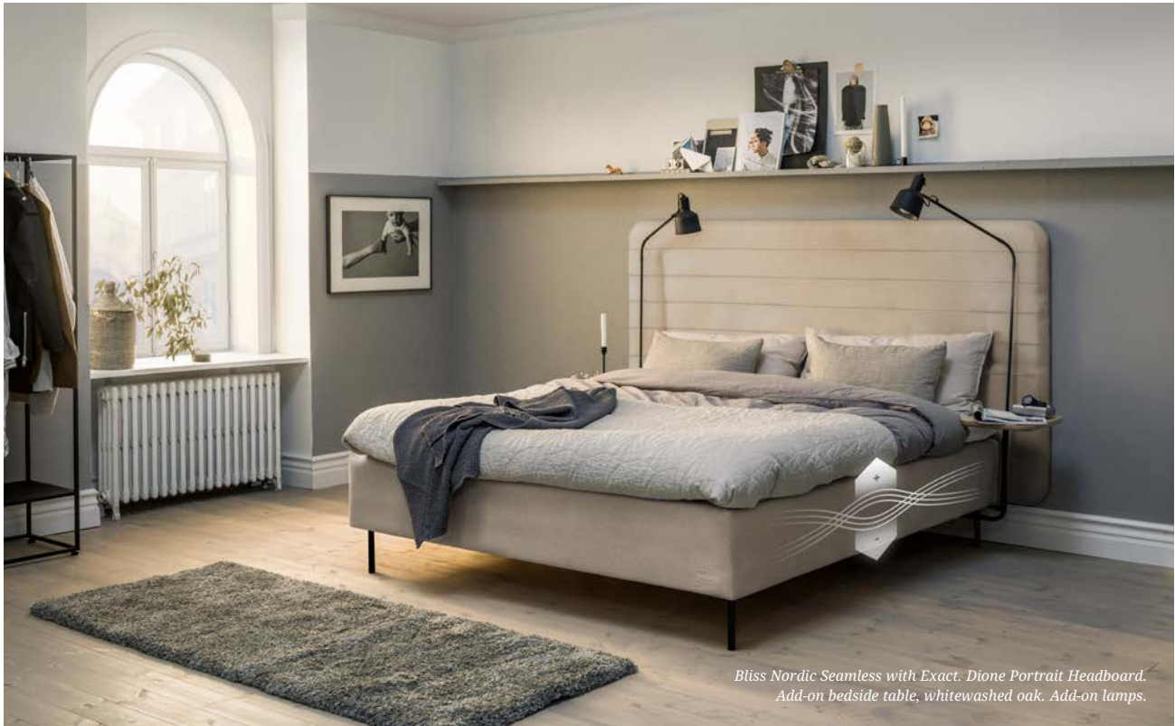
Bliss Nordic Seamless with Exact. Dione Portrait Headboard. Add-on bedside table, whitewashed oak. Add-on lamps.